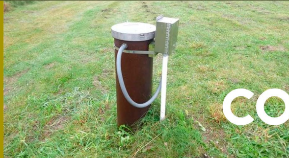
osborne super fund site

CEASRA has established some action items to serve as near and long term goals. As a group, we continue to nurture our ties with the PA Department of Environmental Protection and Department of Conservation and Natural Resources. We also endeavor to monitor local governmental activity through reviewing meetings and agendas. Specifically, we voiced our concern and filed an objection to storing millions of pounds of hazardous material at the Cooper Industrial Commons in Grove City. We also worked directly with the DEP, after identifying a well that is leaking acid mine drainage, to get it addressed through their abandoned well program. We continue to monitor activity around the Osborne Superfund Site.