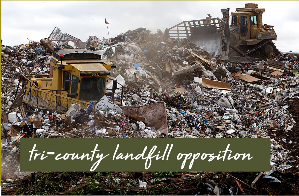
tri-county landfill opposition

CEASRA's longest running endeavor continues to be the opposition to the proposed Tri-County Landfill (TCL) in Mercer County. Tri-County Landfill, and Vogel Holdings, has submitted new landfill plans to Pine and Liberty Townships, as well as the Mercer County Regional Planning Commission. The MCRPC has approved the plans "with conditions." TCL continues to try to submit plans that exceed the PA Commonwealth Court ruling that Tri-County is limited to a 40-foot maximum height restriction. TCL has applied for a new permit and we are vigorously opposing it based upon their documented record of landfill and solid waste violations and economic harm to our community. For example, Vogel's violations included Vogel Holdings, Inc. having to pay $682,500 in penalties (originally 1.2 million). DEP NW Regional Director John Guth said "The penalty reflects the seriousness of the violations committed by the Vogel companies." Some of these violations included transporting illegal gas well wastes, exceeding daily volume limits, failing to control odors and erosion, and leaking garbage trucks.